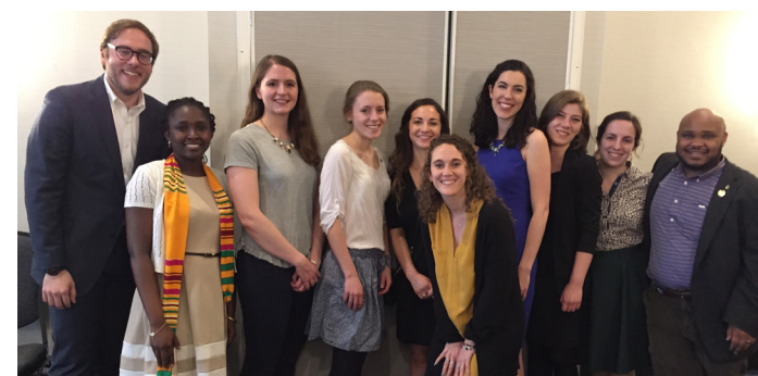
LPP Cohort #10 Graduation Celebration

Our flagship teaching program is the Leadership Portfolio Program – a 14-month leadership development experience for exceptionally motivated GSPIA students. With the graduation of the current cohort of students in April, we will have completed ten years of this unique program which now boasts more than 100 alumni, most of whom are assuming substantial positions of leadership in our community and elsewhere. Graduation is always bittersweet as we bid farewell to students who have participated in the Leadership Portfolio Program in the prior two years while welcoming students who were selected in February for the new entering cohort. The number of partner organizations that provide governing board seats to these students has grown and we continue to expand the number of community leaders who serve as mentors.